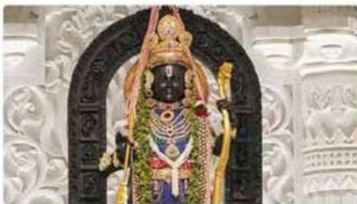
An idol of Lord Ram is decorated with garlands at Sri Ram Janmabhoomi temple in Ayodhya.